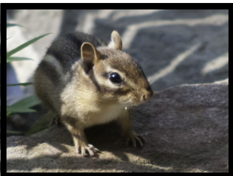
Linda DeGraf © 2015